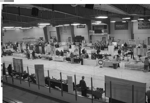
BELOW: The Otsego County Sportsplex was an ideal venue for the Expo, taking advantage of the large floor area offered when the ice is removed for the facilities annual September maintenance break.