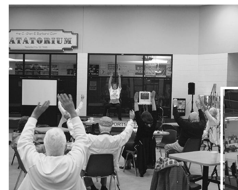
LEFT: Throughout the day special presentations, educational seminars, and even a bit of exercise instruction were a wonderful bonus for attendees at the Expo.