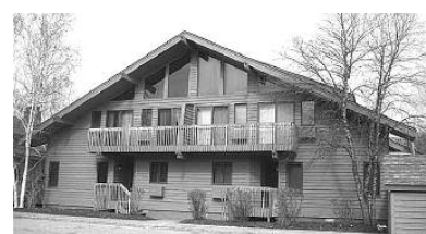
Mancelona • $39,900 6658 Schuss Mtn. Lane