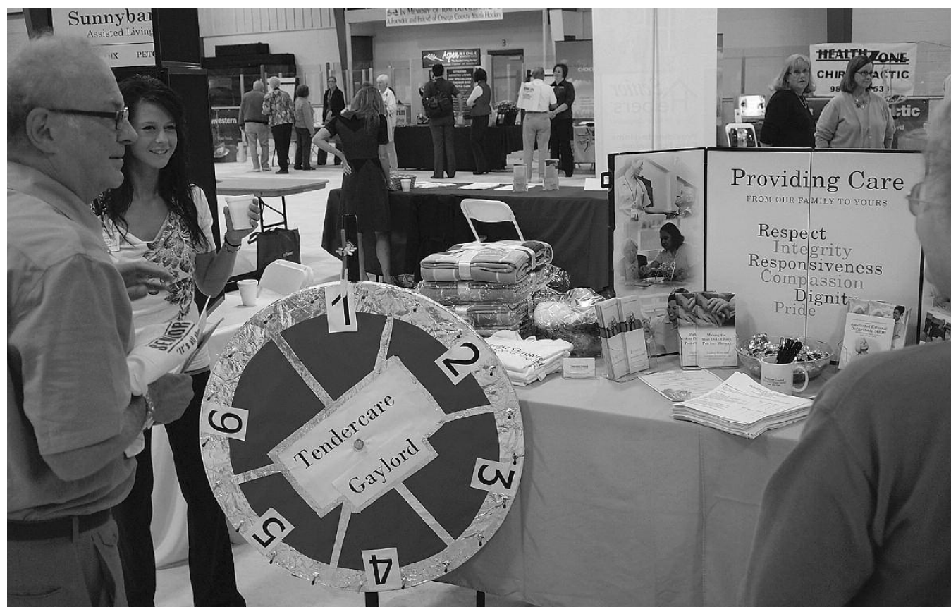
"Spin the wheel and win!" Several of the nearly 50 vendors at the event offered door prizes, free give-away items, and informative brochures about products and services specifically designed for the senior market.