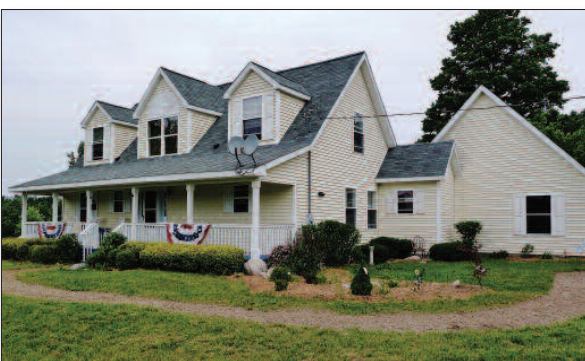
NEWER CAPE COD STYLE HOME with a two car attached garage and bonus room above on 17 wonderful rolling acres—what a setting! Three bedrooms and 2.5 baths with a full walkout basement help to create plenty of space for storage and entertaining. A freshly stained deck overlooks a pond in the backyard and the covered front porch with a vast countryside view tops the outdoor attraction of this property. Priced to move. 430623 $199,900