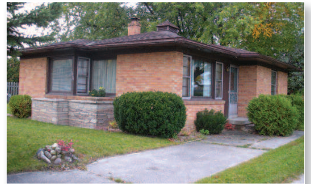
VERY SOLID AND CLEAN BRICK HOME in Boyne Falls. Zoned commercial, with huge views of Boyne Mountain. Full lower level is all set up and ready for completion. An excellent location for the golfer, skier, snowmobiler or fisherman. 428029 $79,900