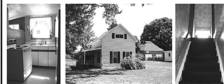
East Jordan • 303 Echo Street • $38,000

INTERNATIONAL RV WORLD 277 EXPRESSWAY COURT • GAYLORD, MICHIGAN 989-448-8700