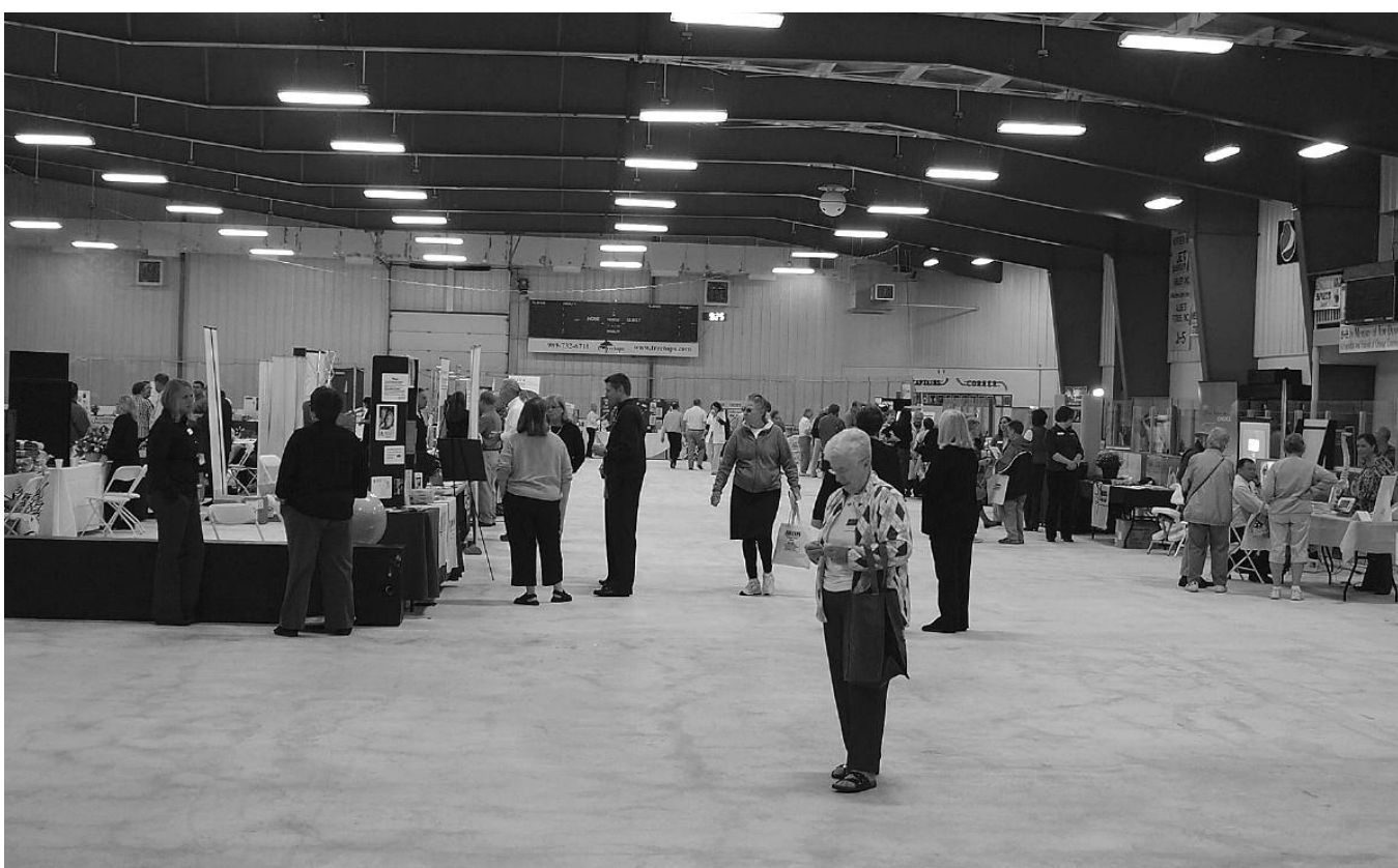
Over 500 people stopped by to enjoy and learn about a host services and products that help make life a little easier as we age at the first ever "It's All About Choice" Senior Expo held at the Otsego County Sportsplex last Wednesday, September 7th.