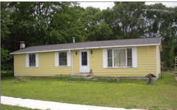
CUTE LITTLE 3 BEDROOM HOME in a quiet Boyne City neighborhood. Close to everything. Wonderful retirement opportunity for someone who may just want to come back to Boyne, or purchase as an investment and rent it out. Full basement. Needs tender loving care, but could be a great house. 430480 $59,900