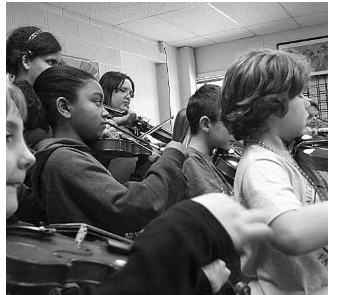
Alanson Elementary Students participating in 2010