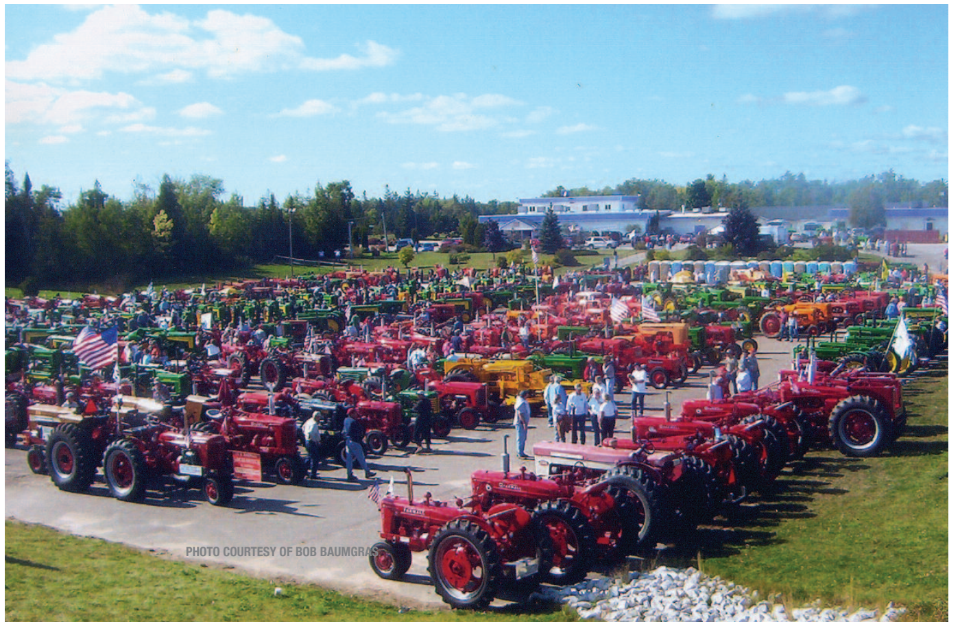
ABOVE: The tractor show will be held at Kewadin Shores Casino all day Saturday and Sunday.