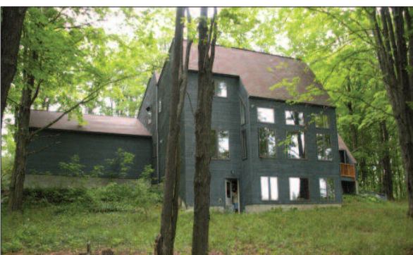
THREE BEDROOM, 2.5 BATH ON 40 IDYLIC ACRES. The property runs the gamut of native Michigan ecology - from hardwood forest to daisy-filled fields. The home is open and spacious, with a timeless floor plan and shady views. Three finished stories, with a main floor master bedroom and bath. The lower level has a family room, and office. 430999 $249,000