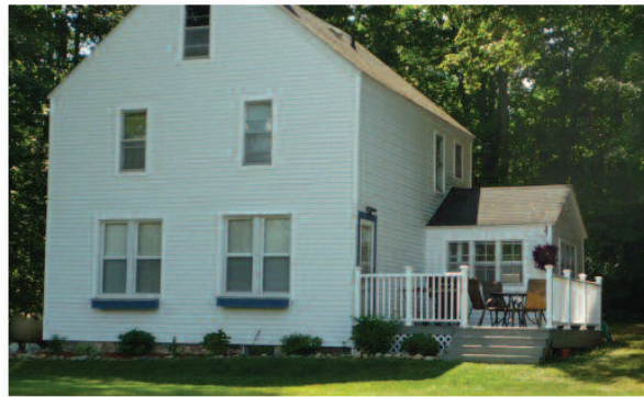
CHARACTER, CHARM AND COMFORT! This wonderfully restored and maintained 4 bedroom farmhouse has hardwood floors, a brand new kitchen, carpet, paint, and much, much more. Updates breathed new life into a beautiful house, melding modern comfort with vintage ambiance. Complete with a large 2 car garage/pole barn with tons of space for all your stuff. 431228 $132,900