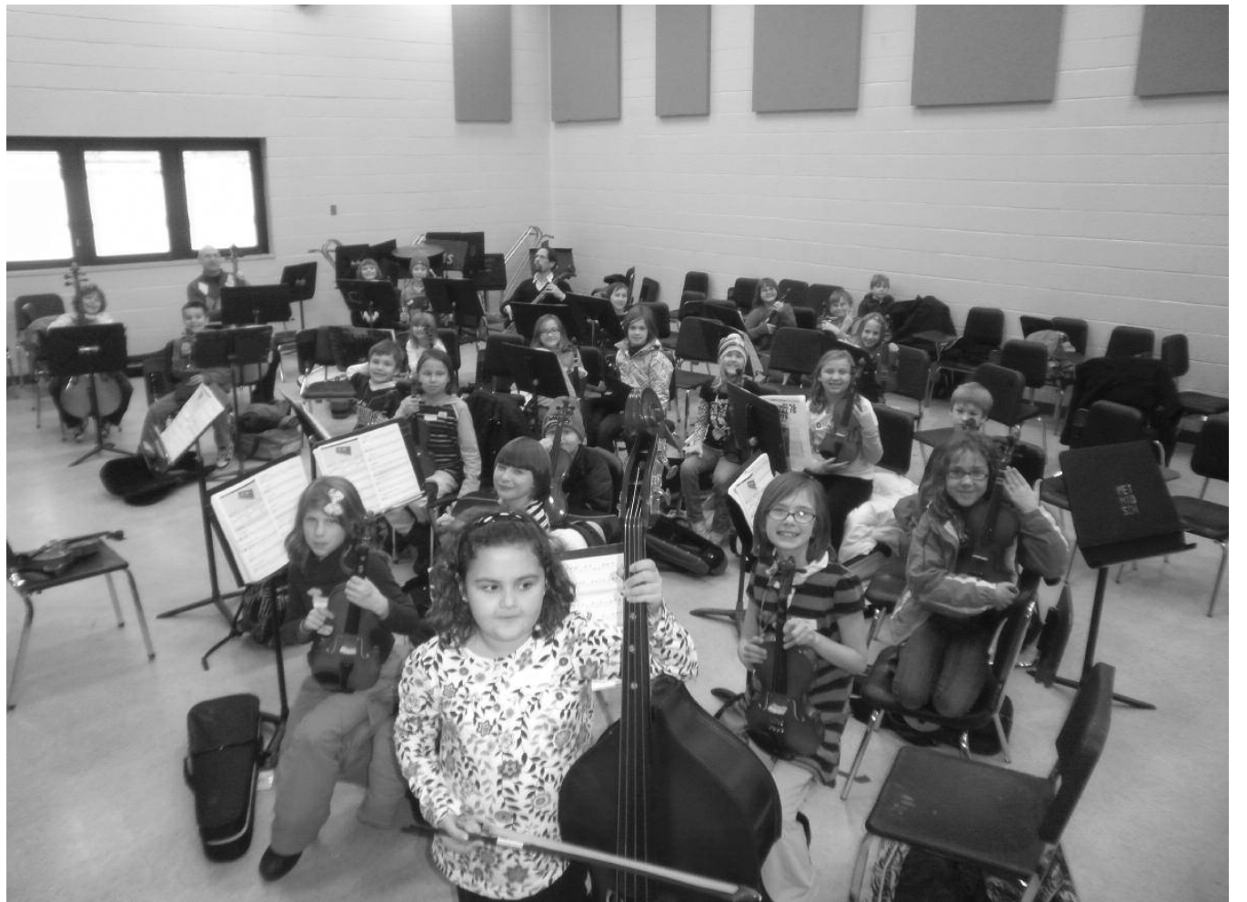
Peoskey Students - Fall 2010