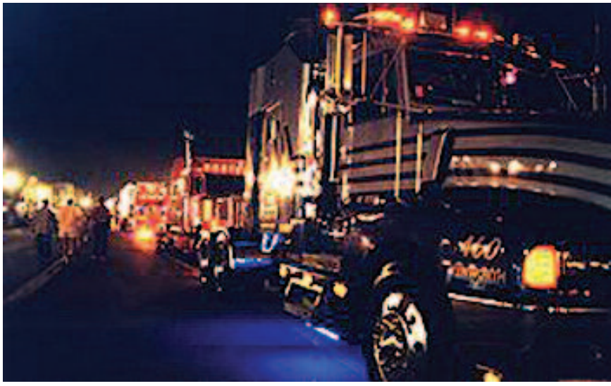
Over 100 Big rigs will light up the night this weekend in Mackinaw

On Saturday, its time for the big rigs, as the 16th Annual Richard Crane Truck Show will bring over 100 eighteen-wheelers to the Straits area. These awesome trucks will be on display from September 16th through the 18th, with show headquarters located at the Little Bear Arena. Along with scores of trucks featuring fabulous paint and artwork, custom chrome and lights and incredible interior design, the show will include several vendors offering very cool toys, apparel and more.