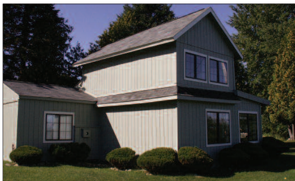
BOYNE CITY AT ITS BEST! This home offers great views of Lake Charlevoix and is in excellent condition. Located adjacent to the Tannery Beach for swimming and stunning sunsets. This 3 bedroom home has many new updates such as a new furnace, water heater stove and refrigerator. Neat, clean and move in ready. 429547 $127,400