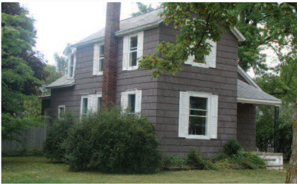
GREAT 3 BEDROOM IN-TOWN BOYNE CITY HOME - one of those older houses with original hardwood floors and interior woodwork, great staircase and wonderfully decorative windows. Large detached garage will be invaluable if you plan on DIY refurbishing. Really ideal family location, close to town, shopping, schools and churches, or could be a delightful second home. 431102 $74,900