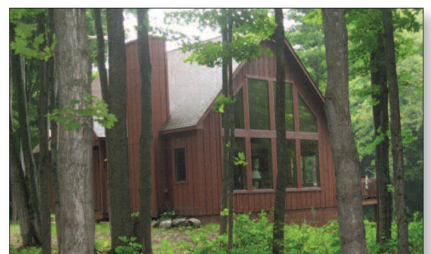
WONDERFUL mixed hardwood 58+ acre parcel rife with wildlife, including the rare elk or bear. The 3 bedroom home is situated in a shady grove with huge windows that bring light and movement indoors, giving the cozy home the feel of a tree house. Beautiful, high-ceiling and spacious living room. Full unfinished walkout lower level - utilitarian, or ready to be finished. 431223 $289,900