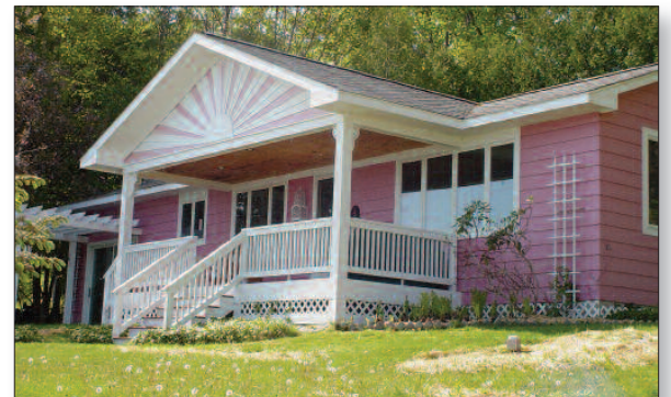
CLEAN AS A WHISTLE! Lake Charlevoix cottage/home just outside of Boyne City. Beautiful views and 100' of frontage. Deck above the garage for summertime dining, sunset viewing, and evenings under the stars. Interior has a bright, neutral color scheme, enlarging the space. Inviting sun room. 429477 $349,000